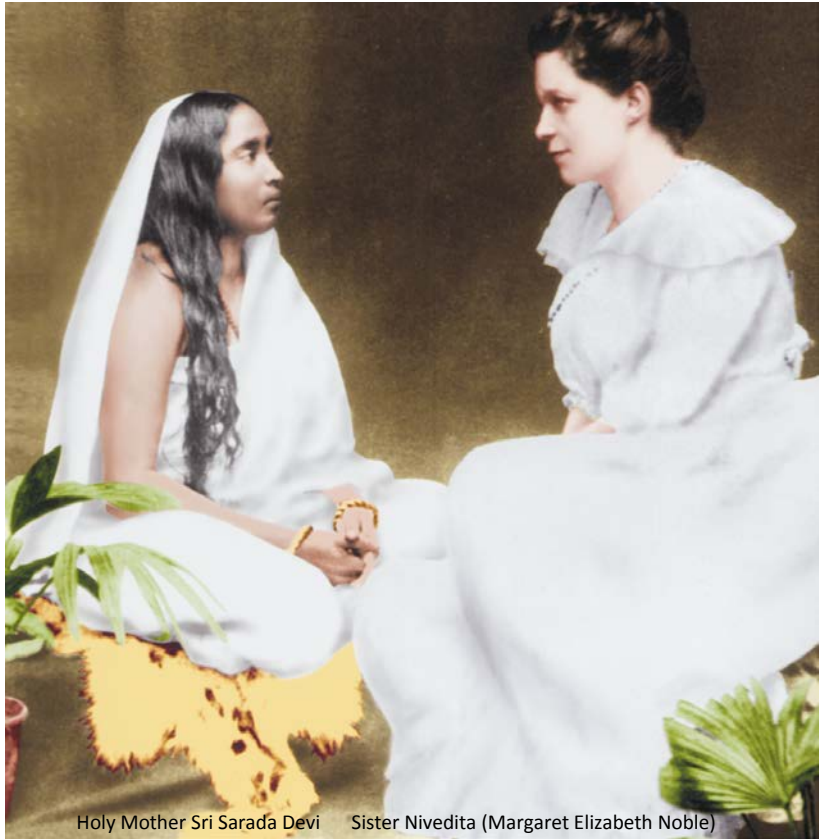
Holy Mother Sri Sarada Devi Sister Nivedita (Margaret Elizabeth Noble)

--First 2 lines from Bhadaranyaka Upanishad, 1:3.28