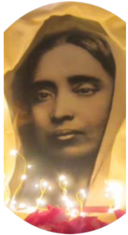
The Holy Mother at the Samiti Shrine.